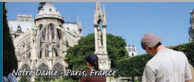
Notre Dame - Paris, France

Savvy business executives know that time management is critical to success, whether you are a busy executive traveling for an important last-minute business meeting, a globe-trotting journalist covering the latest story, or in international sales closing big deals on every continent, Atlas Professional from HCC Medical Insurance Services (HCCMIS) is with you almost anywhere on the planet you may go.