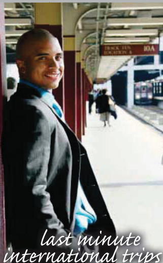
last minute international trips