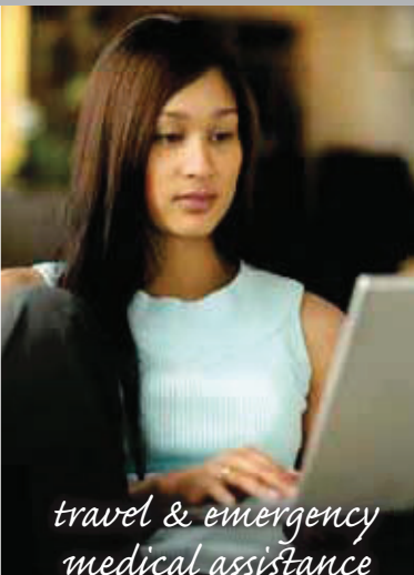
travel & emergency medical assistance