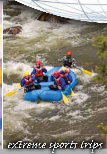
extreme sports trips